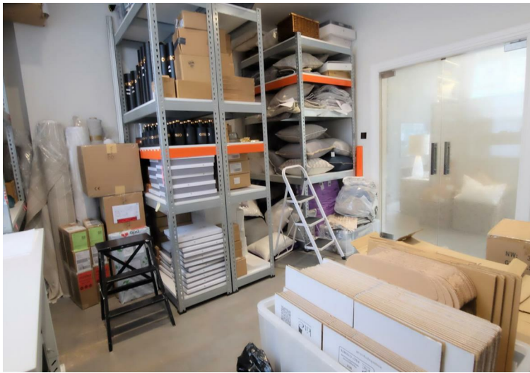
Pond Street, London £32,850 Not specified